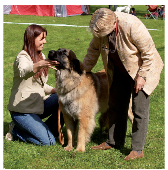
Judging Leonbergers - another strong breed in Sweden.

not surprisingly, followed the path of judging Labradors.